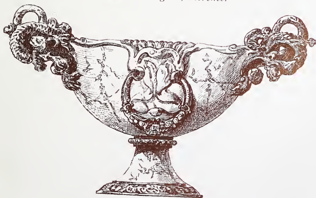
CUP ASCRIBED TO CELLINI. After a Drawing at Florence.